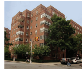
Yellowstone Boulevard Co-op Building 131 Units $3,800,000 Forest Hills, NY