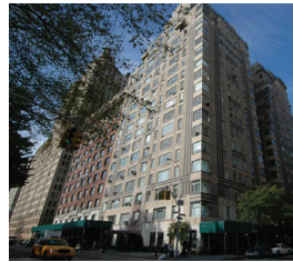
Central Park West Co-op Building 194 Units $14,000,000 New York, NY