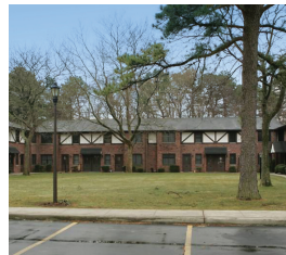
Newbrook Lane Co-op Garden Apartments 212 Units $5,950,000 Bayshore, NY