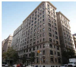
West End Avenue Co-op Building 65 Units $3,300,000 New York, NY