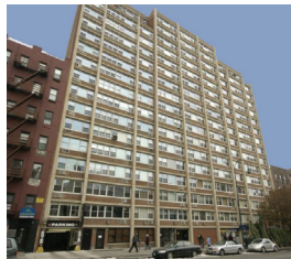
East 74th Street Co-op Building 148 Units $8,500,000 New York, NY