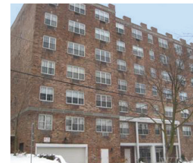
Old Mamaroneck Road Co-op Building 65 Units $2,400,000 White Plains, NY