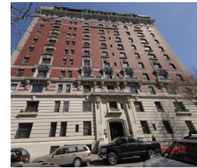
Central Park West Co-op Building 66 Units $10,000,000 New York, NY