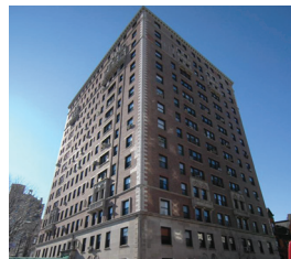
Prospect Park West Co-op Building 43 Units $3,200,000 Brooklyn, NY